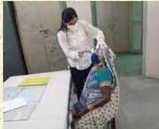
Healthcare, Hygiene & Sanitation

We implement CSR programmes through our own team and also with the help of like-minded partners and local institutions. Diverse community-based CSR projects and multi-stakeholder interventions are focusing on inclusive growth and building a better and sustainable way of living. In FY 2020-21 more than 2,53,584 people in 127 villages (six States) were benefitted by our CSR projects.