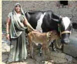
Livelihood & Women Empowerment