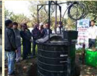
Rural Infrastructure Development